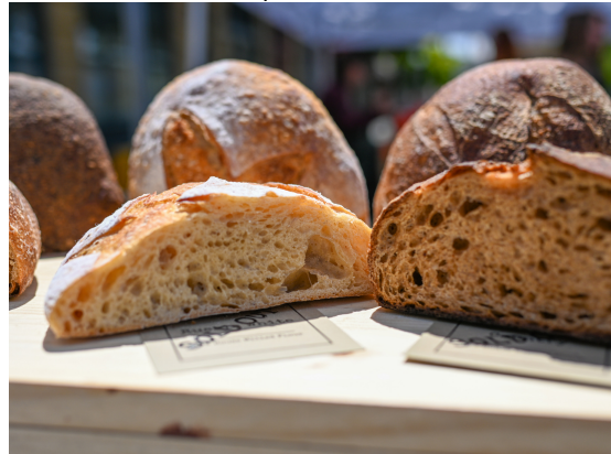
Farmstead Bread, Make sure to get here early!