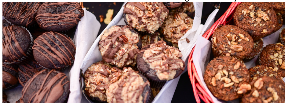
Ladybread Bakery here the first Wednesday of each month!