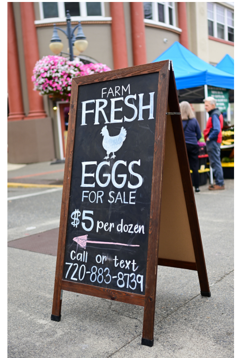
Upside Down Eggs, Local fresh eggs